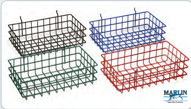
12LZ3 Wire Pegboard Basket, Steel, Chrome Plated, Silver, Rectangular, 10 Gauge Steel, L 14", W 8", H 5" Manufacturer Model: MARLIN 923-12. Usually ships same day. Uses: Displays Parts in Slatwall and Pegboard so that your clients can be more organized. Comes in several colors and also Chrome. Page 917.

The items shown below are always in stock. Don't see what you're looking for—ask about our custom orders