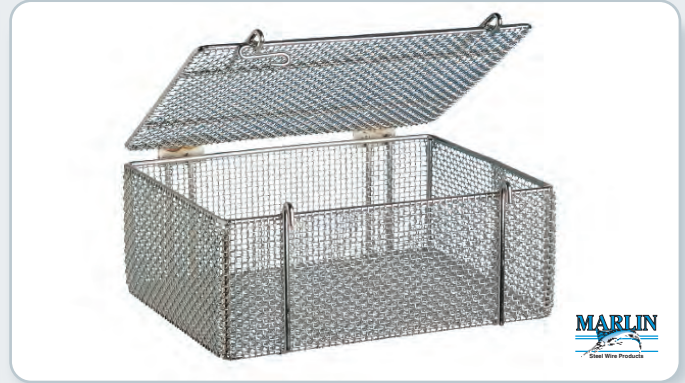
12MA7 Wire Basket, Part Washing with Locking Lid, Stainless Steel, Electro Polish Finish, Rectangular, L 14", W 10", H 6". Manufacturer Model: MARLIN 304002-31. Usually ships in one day. Uses: Parts Washing, Autoclave, Ultrasonic Cleaning, Dipping and Curing Basket. Perfect for instrument cleaning in hospitals or washing gears in a factory. Page 917