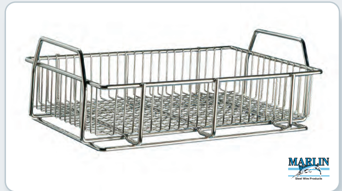
12MA5 Wire Basket, Stacking, Material Handling, Stainless Steel, Nickel Finish, Rectangular, L 19 1/2", W 12 1/2", H 6". Manufacturer Model: MARLIN 286001-11. Usually ships in one day. Uses: Conveyor Friendly Material handling basket with handles. This basket stacks. It is robust and built for manufacturing. Page 917