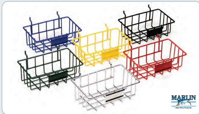
12LY7 Wire Pegboard Basket, Steel, Epoxy Coated, Black, Rectangular, 10 Gauge Steel, L 8 3/8", W 8", H 4 1/2". Manufacturer Model: MARLIN 920-01. Usually ships in one day. Uses: Displays Parts in Slatwall and Pegboard so that your clients can be more organized. Comes in several colors and Chrome. Page 917