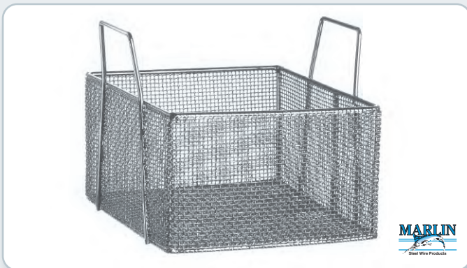
12LX3 Wire Basket, Dipping, Stainless Steel, Electro Polish Finish, Silver, Rectangular, L 12", W 18", H 9", Mesh Size #4. Manufacturer Model: MARLIN 105-31. Usually ships in one day. Uses: Dipping and Cleaning and Ultrasonic Cleaning Basket for demanding manufacturing environments or cleaning in a hospital or pharmaceutical application. Page 917.